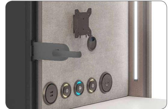
VESA mount / control panel / LED lights

** The calculations are based on the internal volume of the pod and a single fan output.