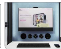
LED + VESA mount